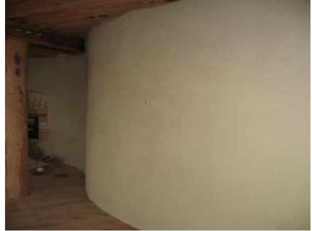
... and walls