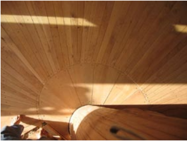
organic forms in floors ...