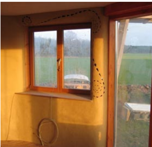
ornaments in the plaster