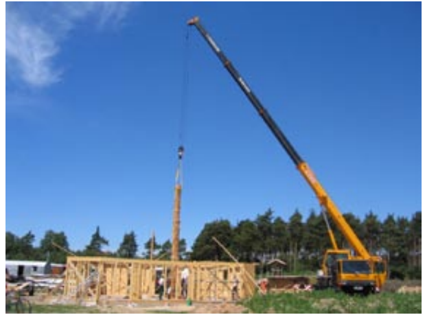
big tree- trunk