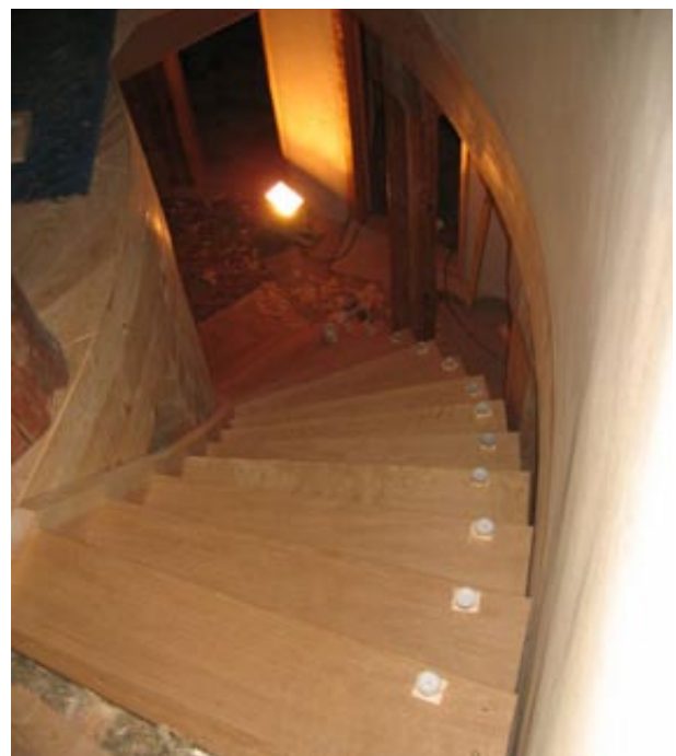
the staircase round the big tree-trunk